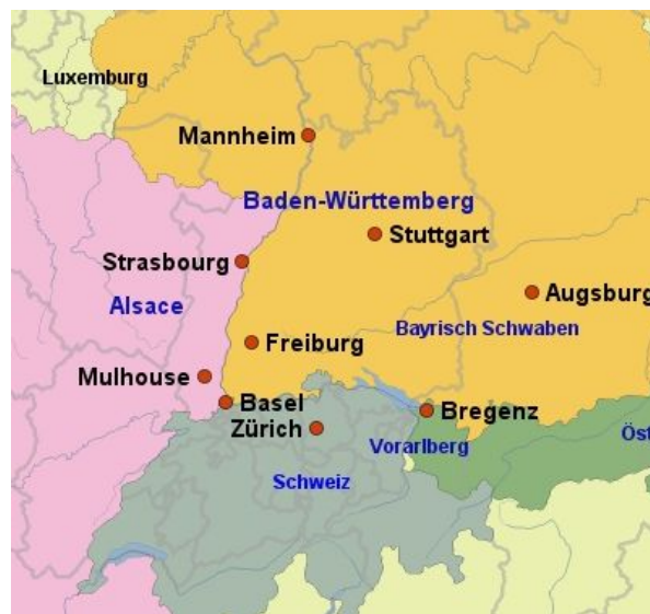
Region of "Alemannia Judaica"

The initial group began as a network, meeting for the first time in Freiburg in May 1988. From this first group the "Alemannia Judaica - Association for the Study of Jewish history in Southern Germany" was founded four years later in Hohenems in Austria. The members of the founding meeting wanted to expand their network to include researchers of Jewish history in Baden-Wuerttemberg, Bavarian Swabia (Bayrisch Schwaben), Alsace, Switzerland and Vorarlberg (Austria). The official founding date was the 24th of May, 1992. The name "Alemannia Judaica" comes from the German dialects spoken in this region, which can be summarized with "Alemannisch".